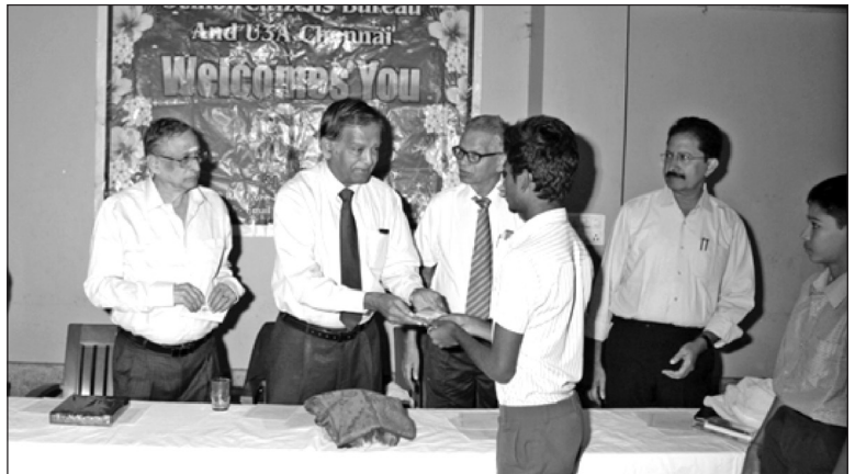
Cash Awards to the Students of Thiru Vi Ka Boys HSS, Shenoy Nagar, Chennai.