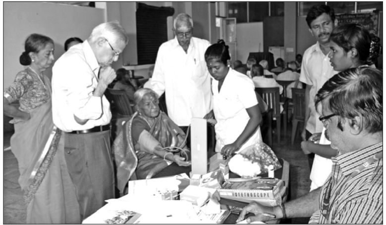
Health Monitoring test in progress.